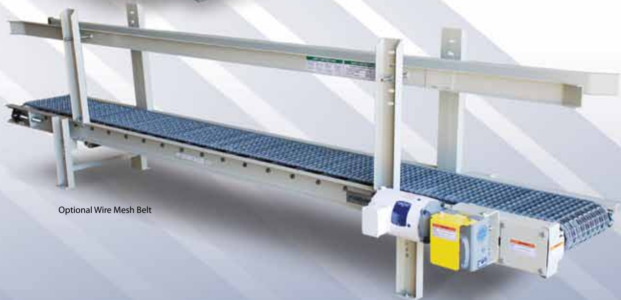
Optional Wire Mesh Belt