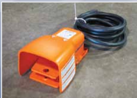
Optional foot operated start/stop switch