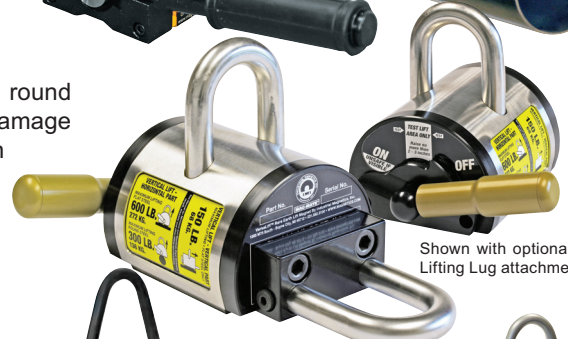
Shown with optional Vertical Lifting Lug attachment

Compact and powerful Rare Earth permanent lift magnet for use on flat or round surfaces. Contains an internal On/Off release device that does not contact or damage the surface of the part. More features than other lifts and manufactured in the USA (USA M.A.D.E.™).