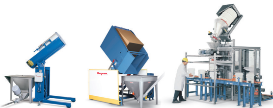
Also available (left to right): Open Chute Drum Dumpers, Open Chute Box/Container Dumpers and High Lift Drum Dump Filling Systems

Most importantly, all are engineered, manufactured, guaranteed and supported by Flexicon—your single-source solution for virtually any bulk handling problem.