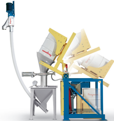
TIP-TITE® Universal Drum Dumper handles drums from 30 to 55 gal (114 to 208 liter)