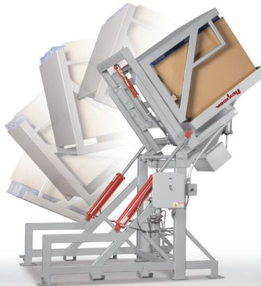
TIP-TITE® Box/Container Dumper handles boxes up to 48 in. W x 48 in. D x 44 in. H (1220 mm W x 1220 mm D x 1118 mm H)