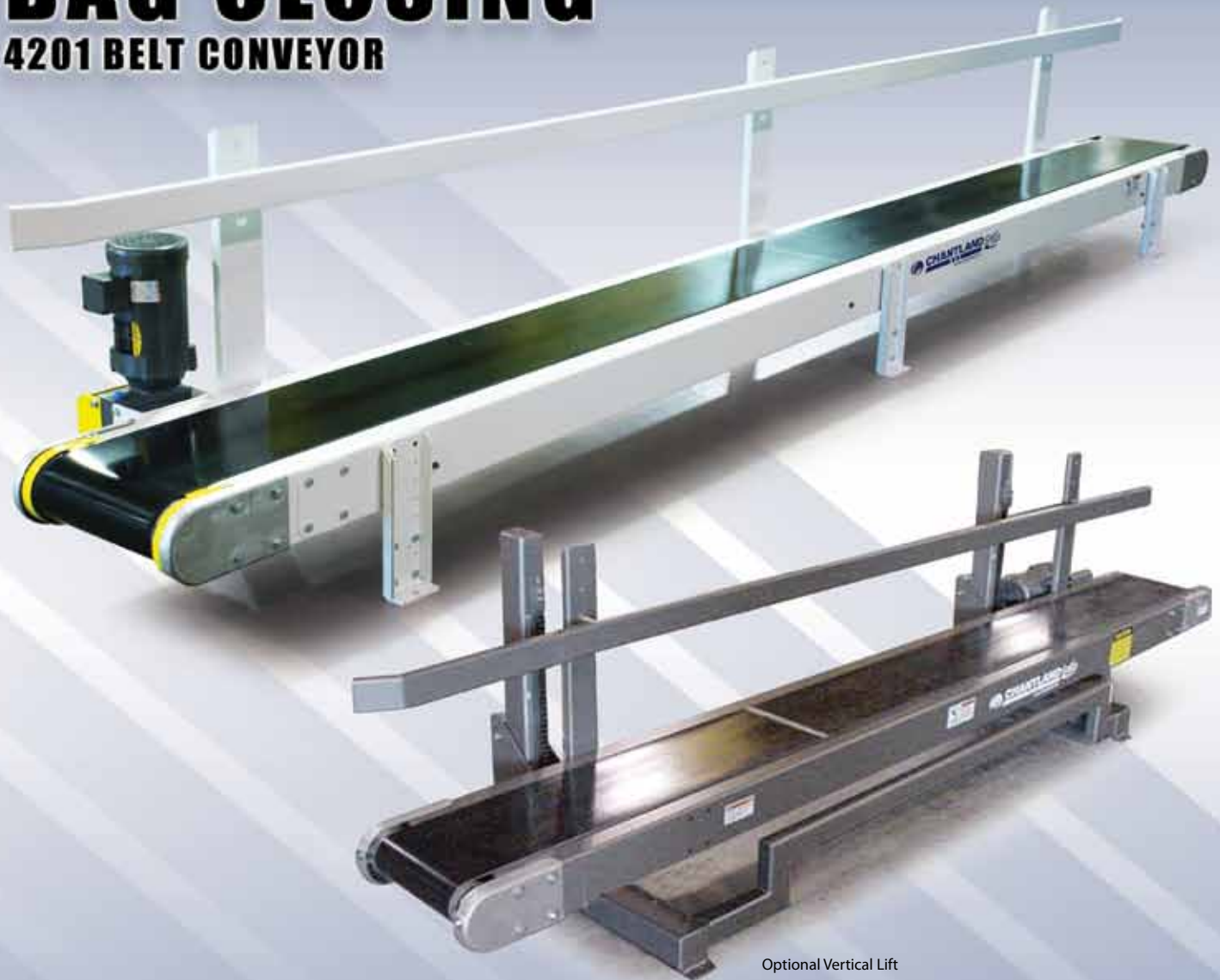
Optional Vertical Lift