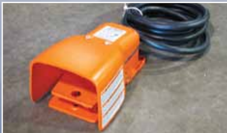
Optional foot operated start/stop switch